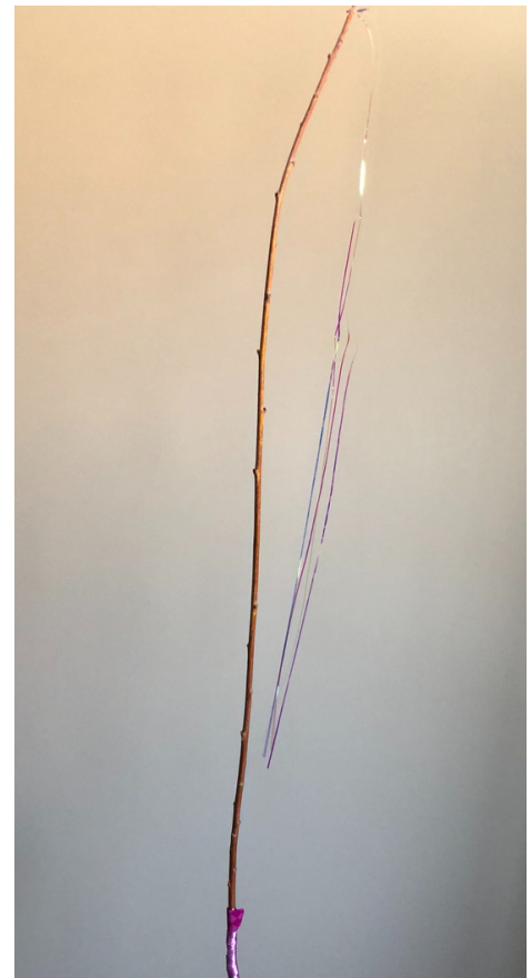
Summer's wand has a Unicorn hair core!

Show off your wands by tagging #PRLStoryCrafts on a Facebook or Instagram post!